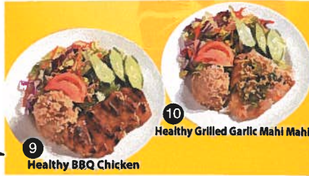
9 Healthy BBQ Chicken